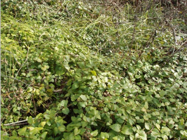
Figure 5. Vinca competing with Santa Barbara sedge.

The existing weed management practices do not appear focused. Piles of pulled weeds were observed along the overflow channel. The primary vegetation within these weed piles was grasses and forbs. It appears that there are some threats existent from major invasive species such as Spanish broom, which are being overlooked. Many of the grasses and forbs within the observed weed piles are nearly naturalized into the annual grassland ecosystem. Development of a weed management program with specific management plans and direction would greatly increase the success of invasive species eradication. Some of the management tools could include hand pulling, the use of goats or other livestock, mechanical, chemical, or prescribed fire treatments. In addition to eradication of invasive species, proactive measures to ensure invasive seed introduction does not occur. Some measures to minimize introductions might include interpretive signage for visitors to make them aware of invasive species identification and impacts, and the development of a protocol to request shoes and clothing be cleaned of seeds prior to entering the preserve.