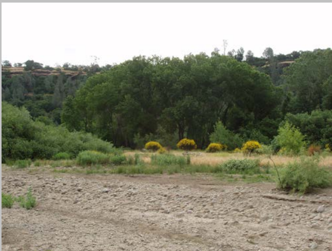
Figure 4. Spanish Broom growing along the floodplain of Butte Creek

Often, the vegetation that has become established in disturbed or embedded soils is dominated by non-native species such as Spanish broom ( Spartium junceum ), yellow star thistle ( Centaurea solstitialis ) and Himalayan blackberry ( Rubus discolor ). Invasive species including Himalaya blackberry ( Rubus discolor ), vinca ( Vinca sp.), cocklebur ( Xanthium spinosum ), yellow star thistle ( Centauria solstitialis ) and Spanish broom are present throughout the preserve. In many locations monotypic stands of these plants dominate the understory of the riparian forest. Patches of native species including Santa Barbara sedge ( Carex barbarae ), mugwort ( Artemisia douglasiana ) and others, which persist in isolated patches among the invasive plants.