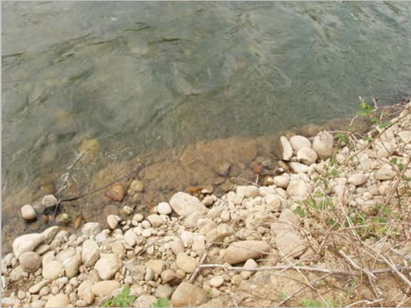
Figure 2. Erosion and undercutting of bank.

Erosion and deposition are natural processes within healthy riparian ecosystems. However, some erosion or deposition can trigger undesirable outcomes. While assessing the bank downstream of the overflow channel outfall, I observed sloughing and undercutting of the bank (see figure 2). Holtgrieve et al. 2000 suggests that bank stabilization should occur as a means to protect fish habitat. This could be naturally occurring due to channel migration; however, it could be caused by debris upstream on the opposite bank or possibly by returning water from the overflow channel. The cause of this erosion should be investigated and efforts to stabilize the bank utilizing natural reinforcement methods ( e.g. , root wads or willow wattle walls) should be implemented as discussed below. If the overflow channel is determined to be a significant contributor to this erosion, then slowing the velocity of flows in the overflow channel with methods previously described may reduce the erosive forces.