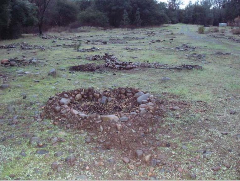
Figure 6. Mounding of rocks around plantings in annual grasslands.

Some plant selections used in restoration plantings are from unspecified origins. In some cases, the stock utilized may not be appropriate to the BCEP or the Sacramento Valley region. Restoration plantings should be comprised of species and their ecotypes appropriate to the Butte Creek watershed or found within relatively short distance of the BCEP. Native seed sources located onsite should be identified and seeds should be collected and increased for restoration. The onsite greenhouse could be used to propagate some of these; however, for larger projects, the Natural Resource Conservation Service's Plant Material Center in Lockeford could be utilized to grow plants for restoration.