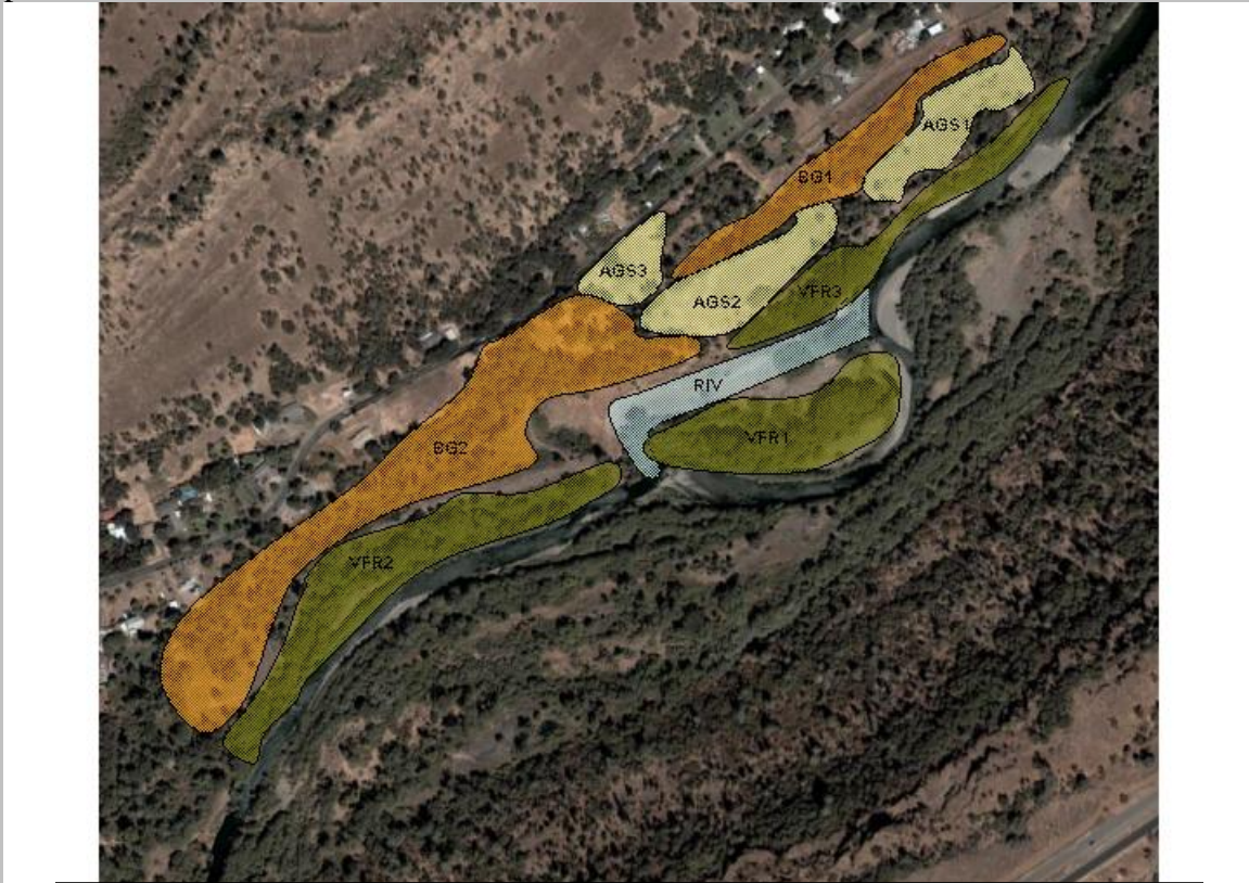
Figure 3. Shaded areas represent major vegetation communities and areas discussed in this assessment. BG = Blue Oak-Grey Pine, VFR = Valley Foothill Riparian, RIV = Riverine, AGS = Annual Grassland.

As stated previously, the vegetation communities at the BCER include valley foothill riparian, blue oak-gray pine, annual grassland and riverine habitats. Figure 3 below provides a general reference to the extent of these communities within the areas of the preserve visited for this assessment.