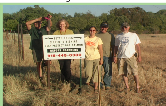
Friends of Butte Creek Board of Directors

News Flash*** Salmon spawning tours are available this fall. Book a tour for your family, friends, and organizations to visit the incredible final dance of the 2008 Butte Creek Spring Run Salmon. Remember, Butte Creek is closed to fishing until November 15.